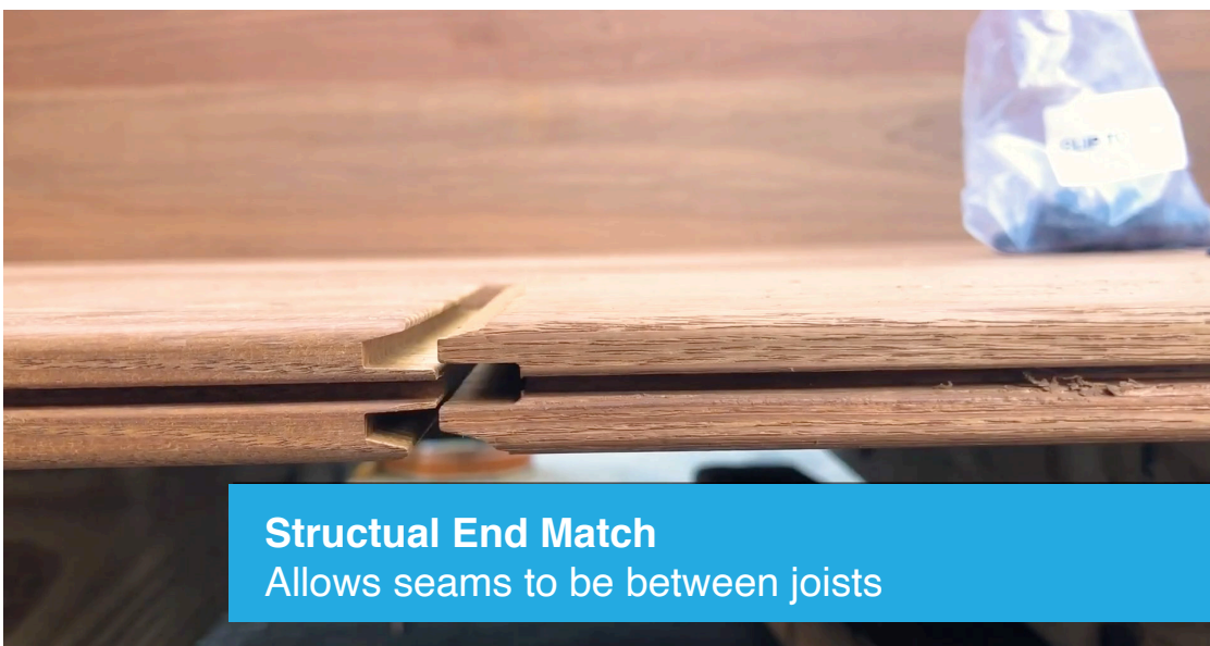
Structural End Match Allows seams to be between joists